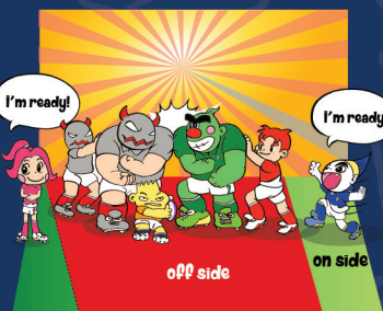
Ruck offside & onside