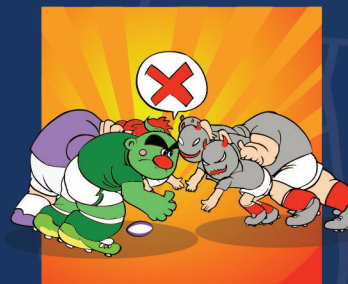
Scrum No push, not contested