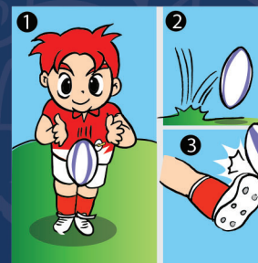
Kick-off Defensive team back 5m