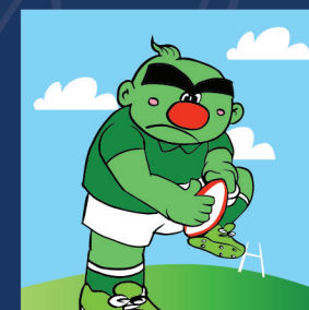
Penalty Defensive team back 5m