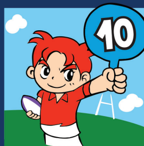
Number of PLAYERS