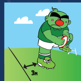
Ball into touch Defensive team back 5m