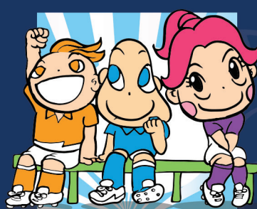
Substitutes ALL substitutes should play